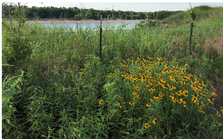
The Riverby Ranch is on the Red River in Fannin County, Texas. Native vegetation is Post Oak savannah. Wheat and soybean fields are being restored to native tallgrass prairie grasses and forbs.

plant community: just put it back together. Regrettably, for our study area, as well as many others in Texas, details are lacking. The reference plant community is painted, ecologically-speaking, with broad strokes. Whereas we know that the “big four”—big bluestem, little bluestem, Indiangrass and switchgrass—dominated the landscape, many other species created a diverse prairie: other grasses like wildrye and gamagrass, and a rich assortment of forbs, both ephemeral and long-lived, clothed these prairies before cultivation. The nearest pristine tallgrass prairie is 20 miles distant, tucked away in pockets as small as 100 acres, where soil lays undisturbed and plant