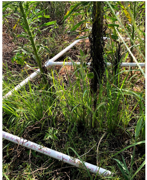
This photo shows a row of Coastal Plains little bluestem plants in a sampling quadrat at Riverby Ranch, Fannin County, Texas, in August, 2020. Also present in the photo are mare's tail and chickweed.

Fannin County, Texas shares the Red River with our Oklahoma neighbors, and on a farm-ranch operation that extends over hundreds of acres, post-oak savannah is interspersed with wheat and soybean fields that have been cultivated for decades. Today, CKWRI and Texas Native Seeds is engaged in a program of tallgrass prairie restoration here. There's that word again: it seems to mean many things for Notre Dame's spire and timbered roof, perhaps just one thing for Caravaggio's masterpieces. What does restoration mean for Riverby Ranch?