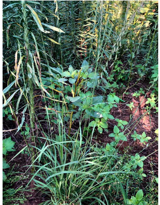
Sideoats grama in full flower at Riverby Ranch, Fannin County, Texas.

Notre Dame de Paris, a cathedral that is the pride of France and a place of worship since the 11th century, burned in April 2019. In just three hours, the roof was all but destroyed and its spire—recognized worldwide—shattered to the floor. Immediately came loud calls to restore Notre Dame...but to what? This glorious structure had been ravaged by fires more than once since its completion, and what burned was not what was completed in 1260, but rather was that medieval structure plus all that had been added to it, modified and extended, over the next 600 years. It's far from clear what "restoring Notre Dame" means. In contrast, restoring a Renaissance painting seems straightforward: when experts look at Michelangelo Merisi da Caravaggio's "The Adoration of the Shepherds," they can see what the artist accomplished with his delicate brush—those clasped hands, those intent faces leaning forward—and all of this can be restored to the original by careful removal of aged varnish.